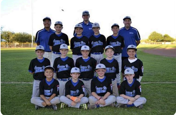
2014 CVLL All-Stars